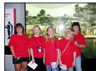
SETX Members at the Moody Gardens Aquarium.

On October 9, 2010 the SETX Self Advocates eagerly boarded a charter bus and headed to Galveston for a day at Moody Gardens. The group explored the Moody Gardens Aquarium, took in a 3D Imax Video, explored Galveston Bay on an old fashioned Paddle Boat, and enjoyed dinner at Golden Corral. In addition to enjoying their time together, members of the Southeast Texas Self Advocates were complimented by Moody Gardens staff for their "positive attitudes." The Moody Garden staff praised them by saying they were "one of the best groups we have had in a long time" The group lived up to their name by showing exceptional leadership and self-advocacy during the trip.